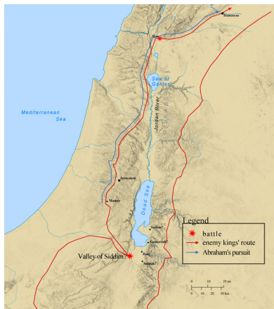
Battle of Siddim and Abram's Pursuit